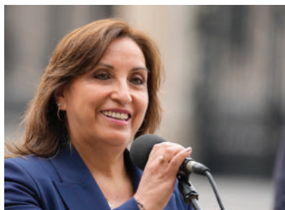
Dina Boluarte – President of Peru

In a country with a long history of male-dominated politics, Dina Boluarte shattered the ultimate glass ceiling by becoming Peru's first female president in 2022. Stepping into office at a time of political instability, she has faced