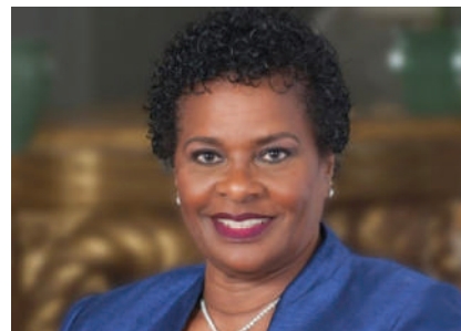
Sandra Mason – President of Barbados

resistance and opposition but has remained firm in her commitment to economic reforms, social justice, and strengthening democratic institutions. Her leadership is proof that women not only belong in politics but can also thrive in high-pressure roles that shape the future of nations.